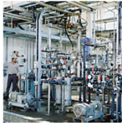
PLASCON® rig at Nufarm Ltd